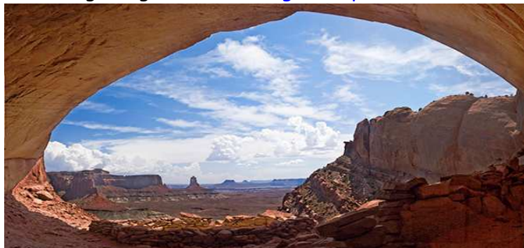
Anasazi Pleasure , Honorable Mention, New Mexico State Fair, 2007!

See our Award-Winning Images! www.geocompa.com/FineArtPortfolio.pps